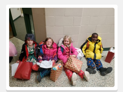
Waiting for the school bus!