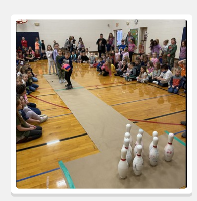
Kindergartener Zenek Hohenfield